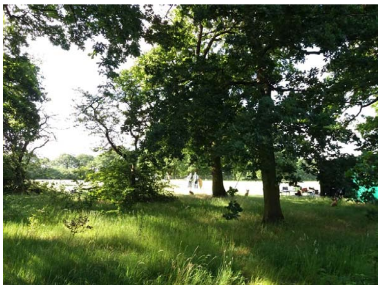
Early morning setting up