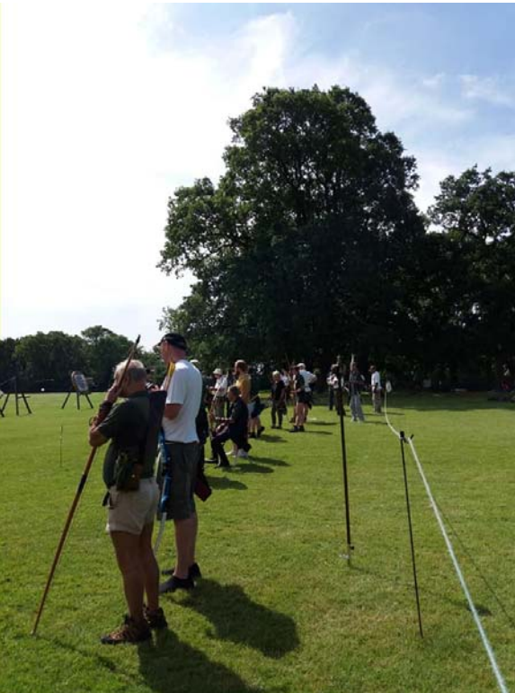
Archers behind the waiting line