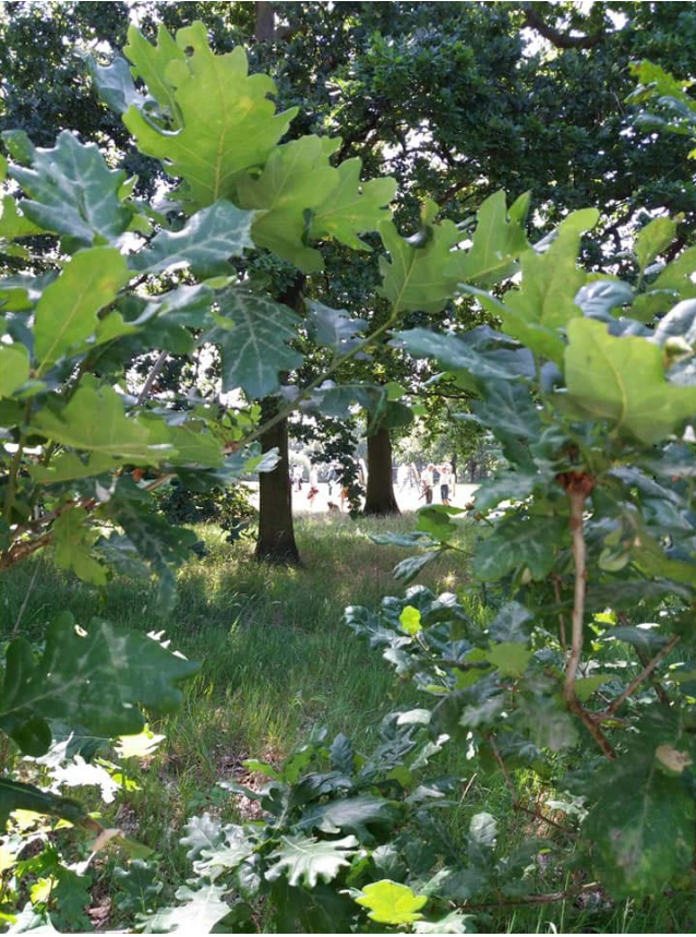
Barely visible raccoon in the distance, viewed from the shooting peg