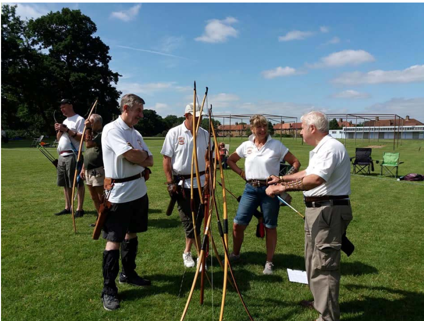
Some of the LPA team discussing tactics or Ray's gaiters