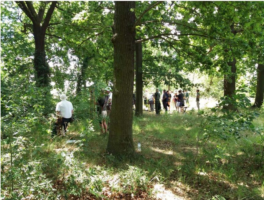
In the woods