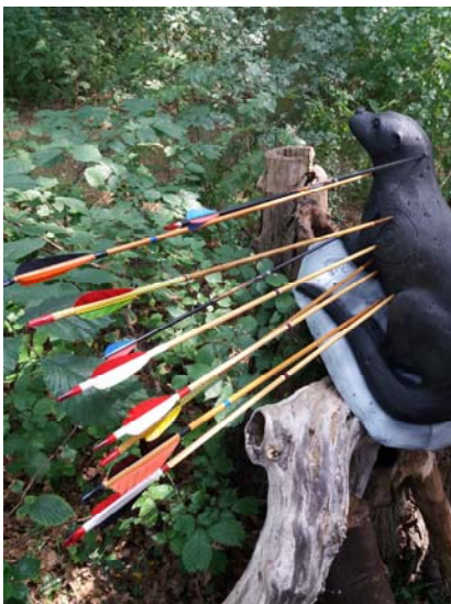
Otter on a log