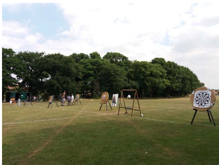
Various targets on the field