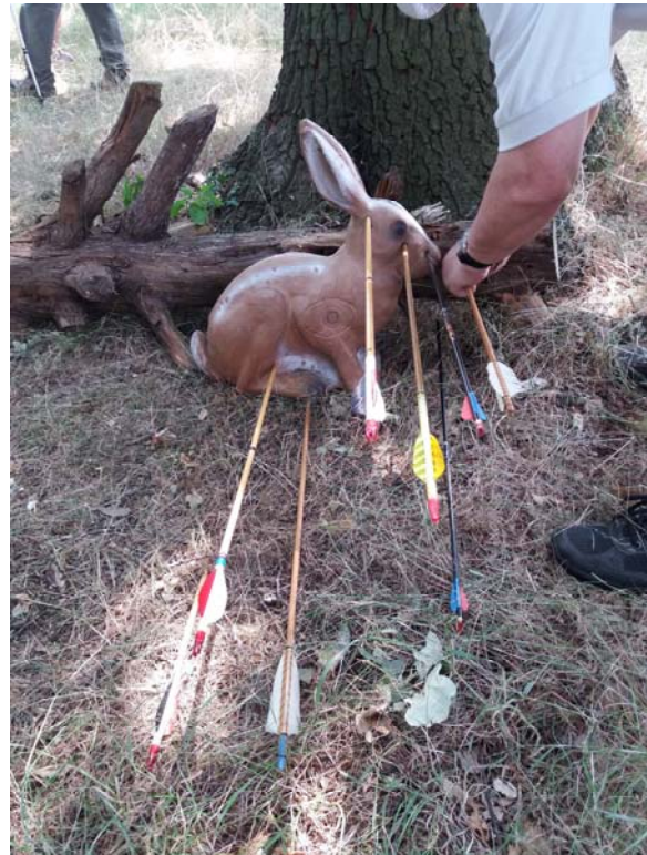
Rabbit in the woods